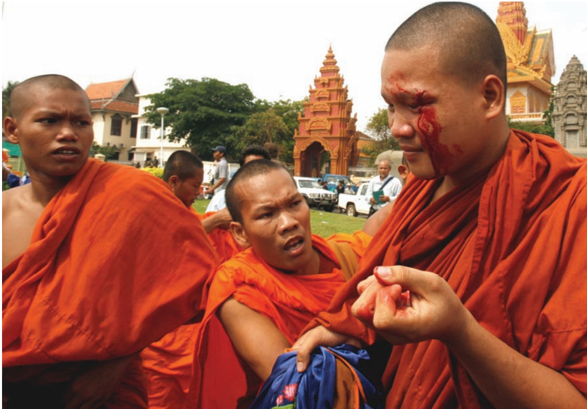
Counter-demonstrators physically attacked Khmer Krom protesters on April 20, 2007 in front of Phnom Penh's Ounalom Pagoda.

On April 20, 2007, police forcefully dispersed another demonstration by around 50 Khmer Krom monks at the Vietnamese and US embassies in Phnom Penh. 187 Later that night one of the monks who had joined in the march was badly beaten by a group of unknown men after returning to his pagoda. 188